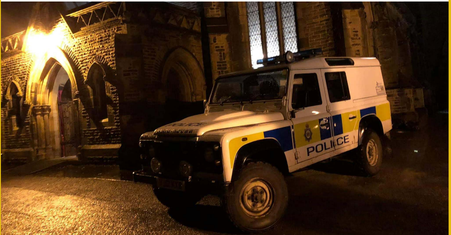
Photo: Police 4X4 that arrived at the scene, from Todmorden Unitarian's Facebook page.

E-Bound Roof Alarm systems continue to record hundreds of alarm activations that have thwarted what were considered attempts by intruders to breach a monitored roof. In support of our mission to eradicate metal theft, we are also pleased by dozens of reports involving thieves caught 'in-the-act', many of which led to arrests by the Police. This is a testament to the reliability of the E-Bound alarm system, which offers a substantial layer of protection by warning of intrusions.